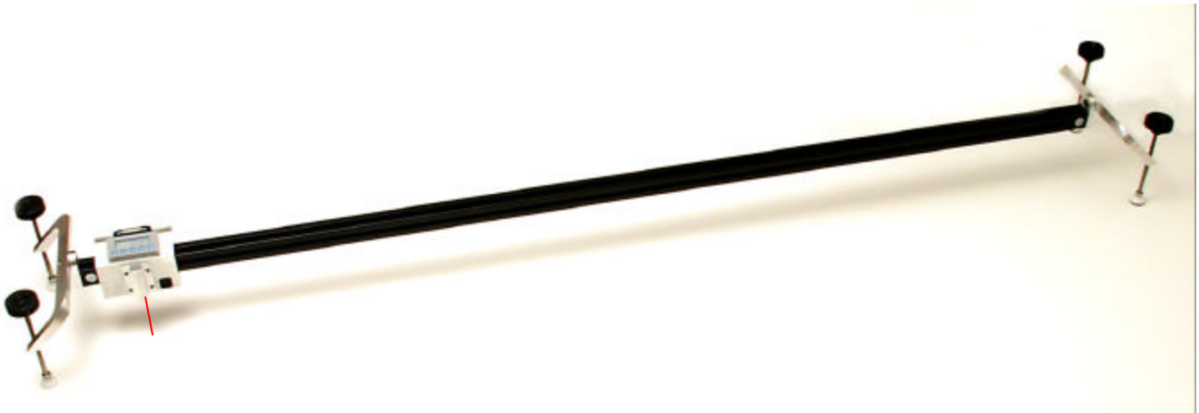
Figure 1: This gauge enables the narrow faces to be positioned within 0.004 inch to Setpoint (at the bottom or top of the coppers). Shown here is the 7-foot model for use on mold widths up to 76" wide. The gauge may be sized to fit any mold opening. The adjustable end feet allow the unit to sit level on practically any uneven surface. The gauge may also be used to verify taper.