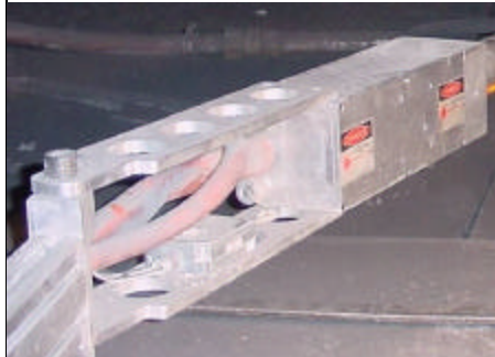
Rear view with optional swivel bracket